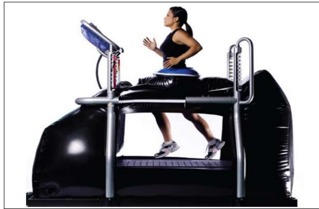
Figure 2. G-Trainer Anti-Gravity Treadmill [3]

The G-Trainer is a rehabilitation device that uses air pressure to unload weight from a patient's lower body and enables them to run on a treadmill with reduced impact forces ( Figure 2 ). The G-Trainer sees use in military hospitals, universities, and on professional athletics teams as a way to relearn proper gait and balance without fully loading an injured body part.