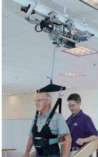
Figure 3. ZeroG Trolley System [5]

The entire system consists of a harness for the patient with support for the groin, hips, chest, and shoulders, a spreader bar to distribute weight, and a trolley connected to an adjustable ceiling track. The trolley tracking system supports the patient without holding them back and is accurate to less than 3 degrees, increasing its ability to prevent falls in the patient [5]. The setup is capable of supporting 400lbs statically and 200 lbs. when moving dynamically [6].